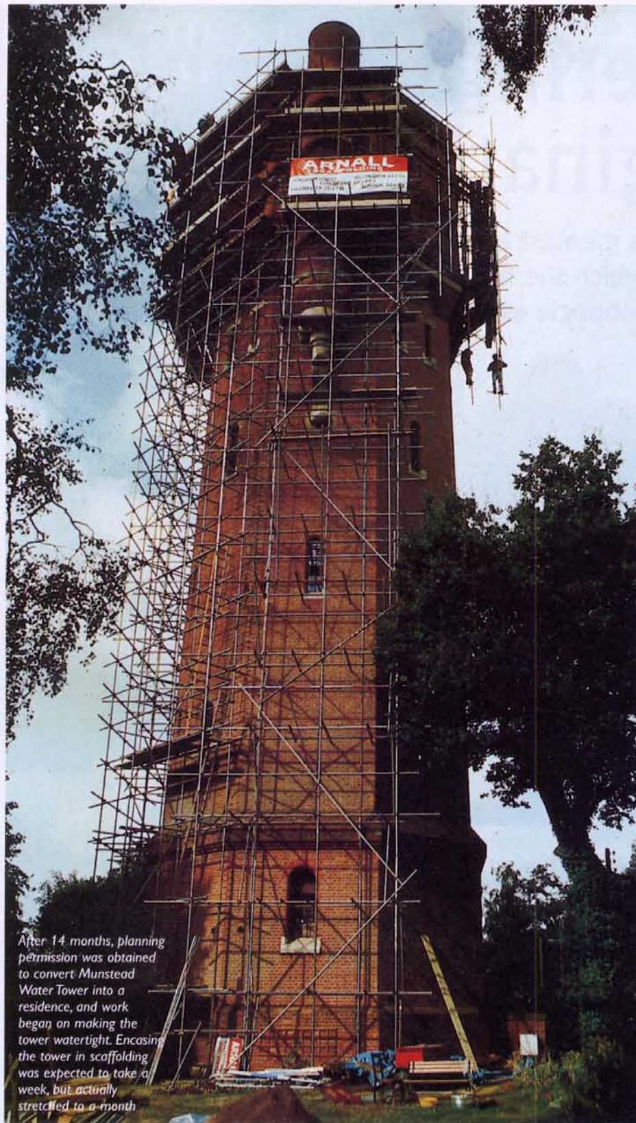
After 14 months, planning permission was obtained to convert Munstead Water Tower into a residence, and work began on making the tower watertight. Encasing the tower in scaffolding was expected to take a week, but actually stretched to a month

of plans to the local authority three months after the purchase. Elspeth takes up the story: "They provisionally turned me down on two main issues – overlooking (i.e. loss of neighbours' privacy), and means of escape in event of fire. They told me I needed to deal with the escape before they could reach a final decision.