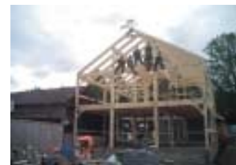
June 3, 5pm