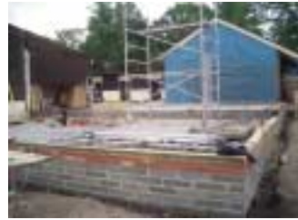
New foundations are put in