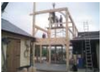
June 2, 11am