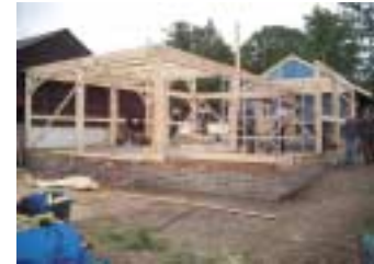
June 1, 5pm