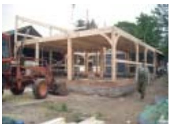
June 2, 10am