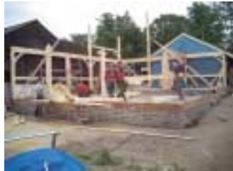
June 1, 1pm