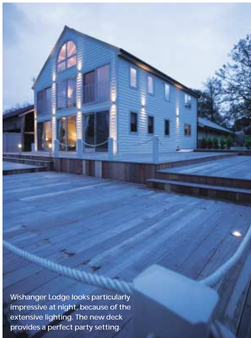
Wishanger Lodge looks particularly impressive at night, because of the extensive lighting. The new deck provides a perfect party setting.

The property was on the market with a guide price of £400,000. "We looked at it that day because we