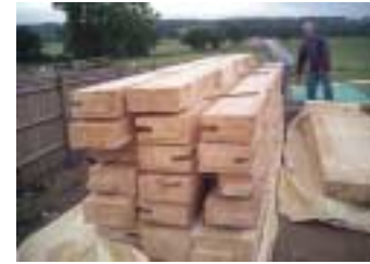
Timber frame arrives on site.