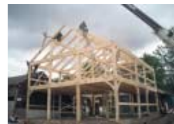
June 3, 3pm