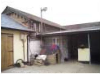
The old building before work.