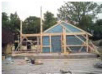
June 1, 10am