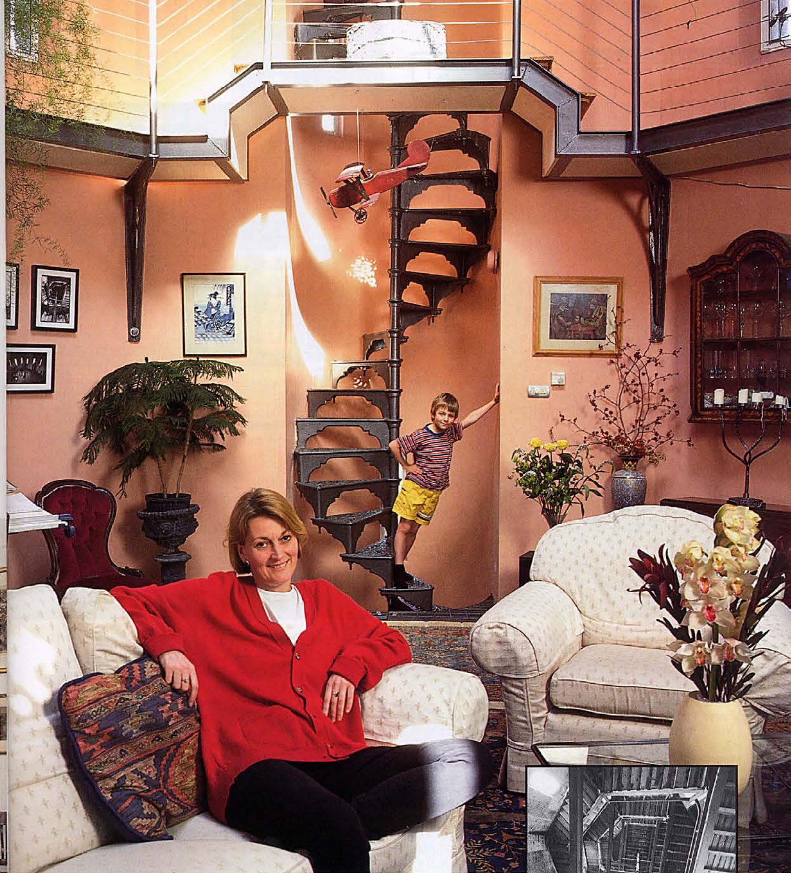
Far left: Munstead Water Tower catches you unawares, suddenly looming above in a country lane near Godalming. Left: the large octagonal hall provides the starting point for a home that stands 130 ft high. Large double doors provide a dramatic exit to the staircase that twists and turns inside the tower. Above: living daylight: The sitting room is reached via the original spiral staircase.