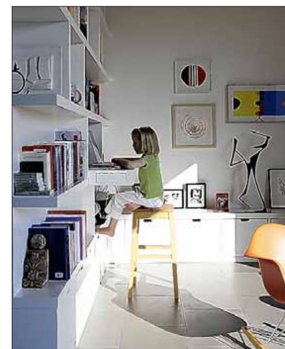
Tucked away in a corner of the living room is an area where the children can draw and write by themselves