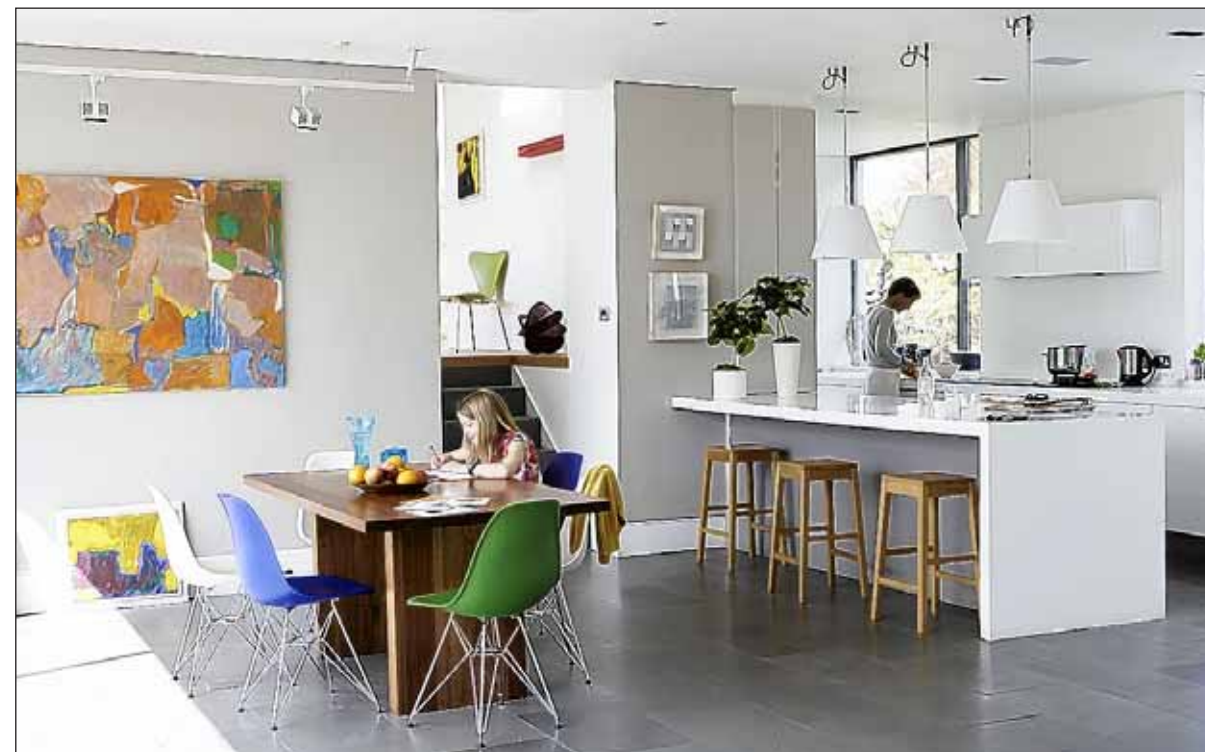
Clockwise from above: the elevated living room, with its own balcony, is borrowed from the original bungalow; the kitchen is where the family congregate, says Annabel Agace; the white décor in the family area is broken by a colourful painting; the kitchen is positioned so that the whole house can be seen from it