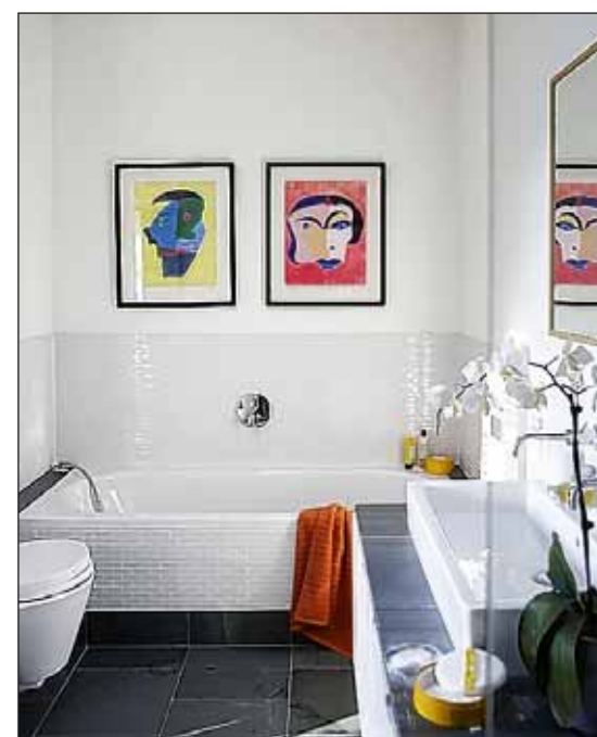
As with the kitchen, the bathroom has been kept in neutral white, with colour provided by pictures

■ This feature appears in the July 2007 issue of Livingetc, on sale now.